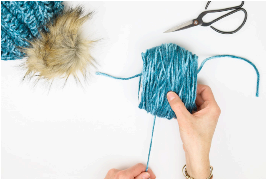
Photo F - making a yarn pom pom