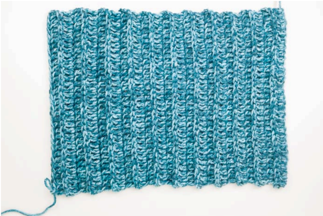
Photo B - orientation of rectangle for seaming (right handed) Left-handed orientation = working yarn tail on the top left