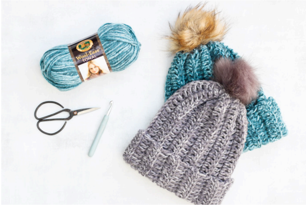
Photo A - Lion Brand Wool-Ease Tonal yarn