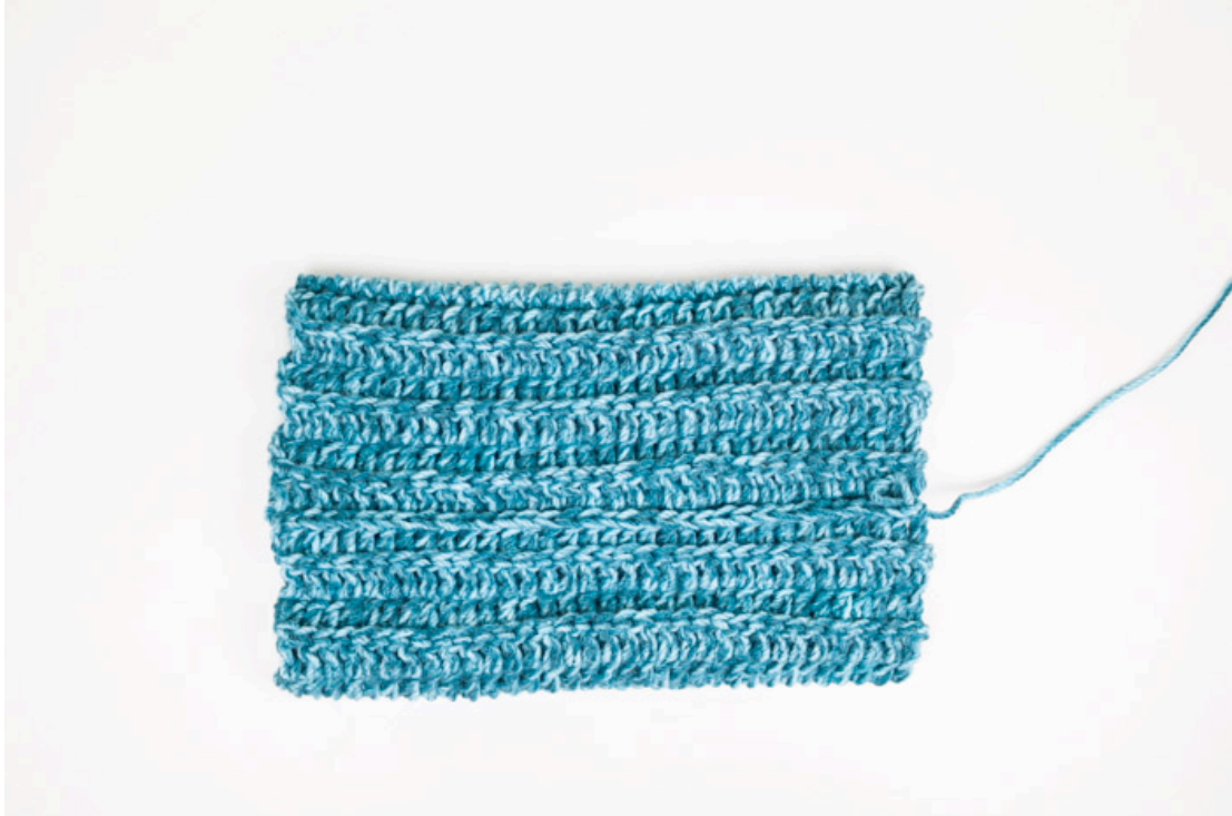
Photo C - rectangle folded and ready for seaming