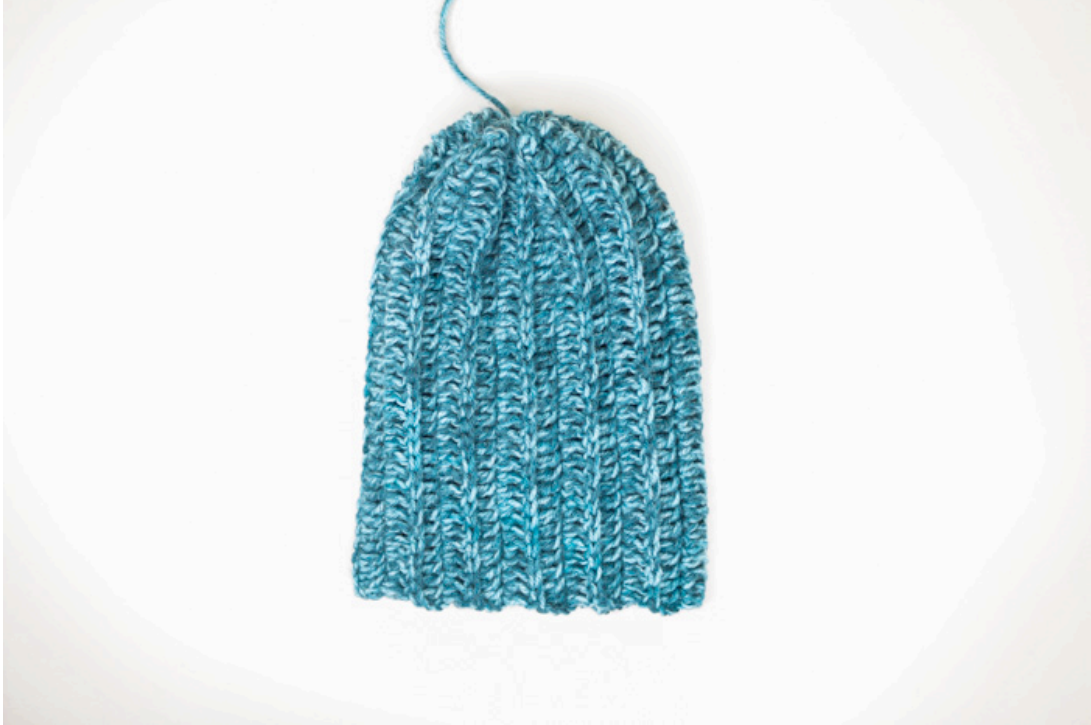
Photo E - side and top seamed